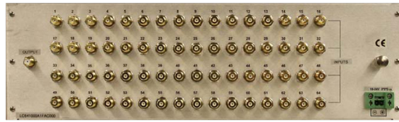
LC64 1000A 64-way Active Broadband Combiner